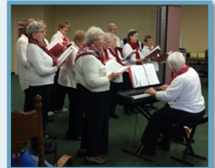
The Friends in Harmony Choir

Friends in Harmony Choir Mountain Dulcimer Ukulele