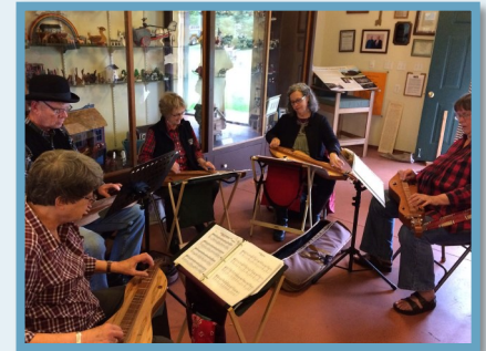
Dexter Dulcimers at Fall Festival

The Dexter Senior Center hosts a series of presentations on Monday afternoons. Topics include healthcare, caregiving, and fitness with occasional educational talks and musical guests.